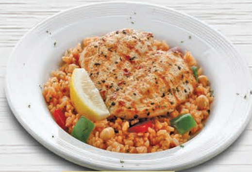
SPICY CHICKEN FILLET WITH BROWN RICE PILAF

Our golden waffles layered with roast beef, drizzled with gravy and topped with caramelised onions and cheese 28