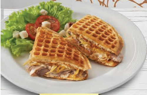
ROAST BEEF WAFFLE