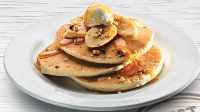
CARAMEL BANANA WALNUT

You'll go nuts over these rich and flavorful walnut-filled pancakes (2 pcs) 25 (3 pcs) 28