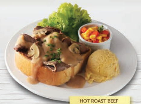
HOT ROAST BEEF

Flavorful brown rice pilaf paired with tender chicken paillard and garnished with garlic cream mayo, chopped parsley, and lemon wedge 32