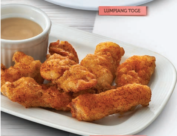
SPICY CHICKEN FINGERS