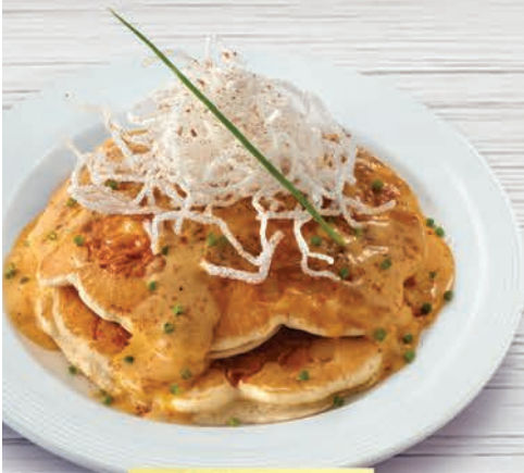
FIRE NOODLE CHEESE PANCAKE

Marinara-style pasta—shrimps, mussel, cream dory and tagliatelle tossed in a tangy tomato herb sauce 30