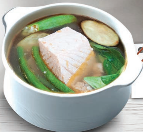
SALMON SINIGANG SOUP

Chicken Corn Soup 15 Almondigas Soup 15 Salmon Sinigang Soup 15