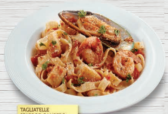
TAGLIATELLE SEAFOOD GAMBERO