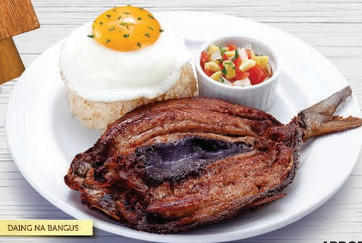
DAING NA BANGUS