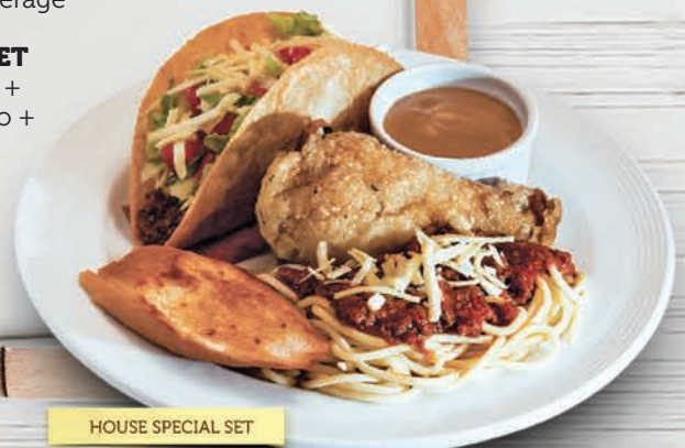
HOUSE SPECIAL SET

Almondigas + Fish Taco + Adobo Taco + Meat Taco + Beverage