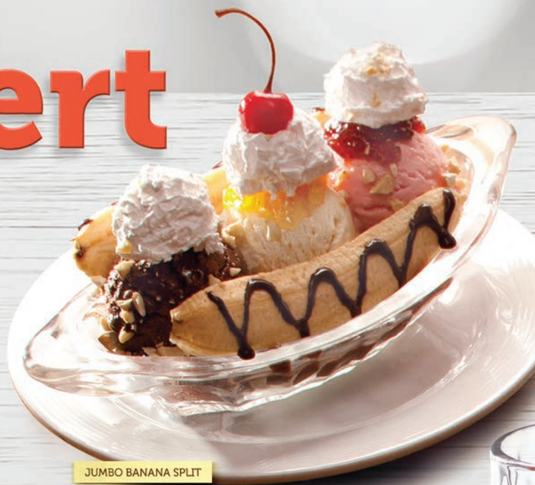
JUMBO BANANA SPLIT

Choco chip-filled pancakes with whipped cream in between, dusted with cocoa powder and topped with chocolate ice cream, chopped walnuts and chocolate syrup 22